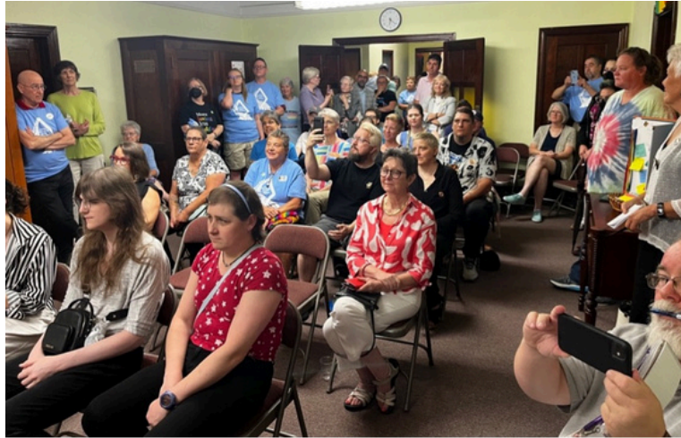
Pictured above: Community members gather to support the grand opening of Prism

“Prism is going to be a place where any person of faith or no faith can come to be fully and freely who they are. We want Prism to last for a long time in our community.”