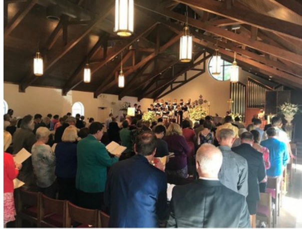
Pictured above: The congregation of Northminster

Fifty years ago, a small group from the American Baptist Churches, USA had the audacity to speak for God's radical love and welcome for all. This group, named American Baptists Concerned, advocated for their own inclusion as well as for the congregations who were on the path to being disfellowshipped from ABCUSA for their affirmation of the LGBTQ+ community.